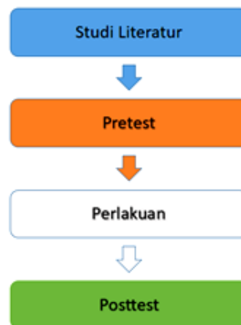
Figure 1. Research stage of blended learning

posttest design. Tests performed twice ie, before the experiment called pretest and post-test experiment called the posttest. This research was conducted at the University of Muhammadiyah Prof. DR. HAMKA. The following stages of the research carried out, shown in Figure 1.