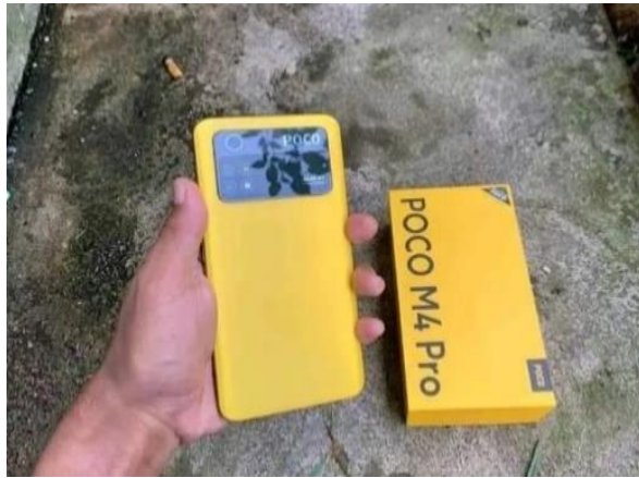
Figure 2. Personal items for sale

We found that the impact of online slot gambling games was that school children planned to sell their valuables. This action was very detrimental to him, considering that cellphones are communication tools that should be used for personal purposes. However, he chose to sell it and use the proceeds to fund online slot games.