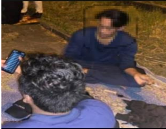
Figure 4. School children gather outside the house at night

We found that school children often gather with their friends at night, in this gathering they spend time outside the house so that they return home late at night. In situations like this, school children should not do this, because time is a vital value that is useful for school children to use, especially when outside school hours it should be used for rest or studying. This has a significant impact on their physical health due to lack of sufficient sleep.