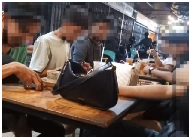
Figure 5. School children's friendship environment

Using time that should be used for rest at night to hang out with friends outside is not a good habit for a student, because it can have a bad impact on his psychological health. Then the researcher observed social relationships with his friends. In this case, they tend to have closer social relationships with friends who also play online slot gambling. Based on observations, they more often talk about gambling sites and ask each other about it when they gather with their friends.