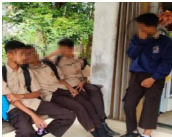
Figure 1. School children do not travel to their respective schools.

We witnessed that school children did not go to their respective schools, but gathered with two other friends in a shop. From the observations made, researchers saw school children topping up funds at the shop, which they planned to use to play online slots. Apart from that, researchers obtained information that the two informants had promised their friends not to go to school that day and intended to play billiards on Road Haji Husein 2.