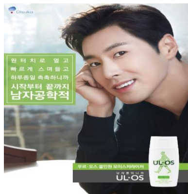
Figure 3: UL.OS advertisement

Below is the UL.OS advertisement (Fig.2) which is the product of moisturizing male skin showing South Korean model, product, and Hangeul-written verbal known as intermodal relations. Ideational meaning is applied to identify and analyze this intermodal so that the representational meanings can be found through the choices of verbal, image, and circumstance.