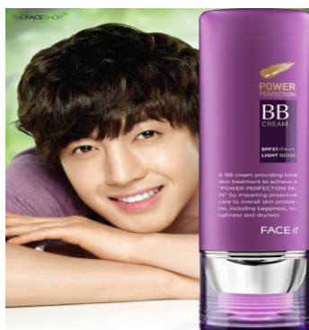
Figure 5 (source: https://id.pinterest.com/pin/346566133802566549/ )

models, product, and with no verbal process. The elements of ideational meaning (participant, process, and circumstance) are described in the table 3.