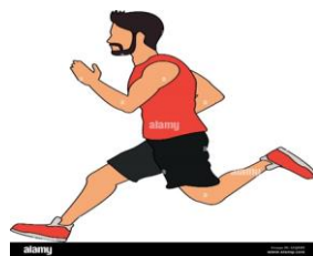
Figure 2.

The data were analyzed by identifying the ideational meaning in the advertisements which is a reference to Halliday's three metafunctions: ideational, interpersonal, and textual. Kress and van Leeuwen (2006) suggested that the concept that ideational meaning can be demonstrated through the picture which consist of several elements: participant, process, and circumstance. The participant refers to character shown on the picture as the object who can do or experience something. The concept of process is used to identify imagery event or the activities imagined by drawing techniques. Whereas, the concept of circumstance can be seen from the setting or other elements used to identify participant and process. The data were Korean male skincare advertisements that consist of participant, process, and circumstance as the elements of ideational meaning. The example of analysis is described as below: