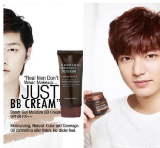
Figure 4

The second advertisement is Dandyguy (Fig.3) as the product of moisture BB cream or Blemish Balm intended for male skin that shows two South Korean models, product, and verbal written in English. The elements of ideational meaning (participant, process, and circumstance) is utilized to reveal the representational of this advertisement.