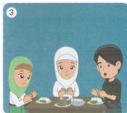
Picture 1. The example of spiritual