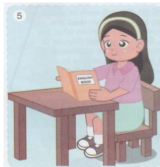
Picture 2. The example of reading interest

Reading interest is a habit to take time to read the various readings that give students the benefit (Ministry of Education, 2010). By reading, students can acknowledge more about anything and it cannot be denied that reading is the foundation of academic skill. The value of reading interest only emerged in few pages in all textbooks and it can be seen through some passages and pictures in the textbooks. Reading will open up student opportunities to absorb as much information as possible. Reading will foster students' ability to think creatively, critically, analytically and imaginatively.