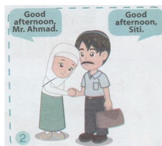
Picture 6. The example of courtesy