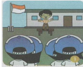
Picture 5. The example of patriotism

Materials like national days in Indonesia and flag ceremony were the example of appreciating the sacrifices of heroes and heroines as can be found in the textbooks. The material I'm proud of Indonesia and Map of Indonesia teaches students about pride and love toward what this nation has. Knowing the environmental, physical, social, cultural, economic and political of the nation can teach students to realize how great and rich the country is. Meanwhile, the sentence like You should read more stories from around Indonesia teach students to appreciate the richness of Indonesian culture.