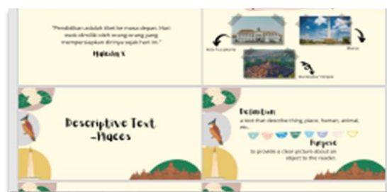
Figure 1. Material for Cycle 1

The material used in this research was Descriptive Text of tourist attractions and historical places. The researcher and the teacher discussed the material together. Next, the researcher created a file containing the material, then uploaded it to a padlet in PDF format that will be used during the learning process. This material included the meaning, purpose, generic structure, and also the language features of descriptive text.