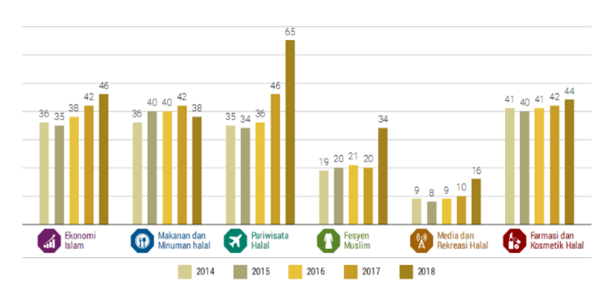
Figure 1: The development of the halāl industry