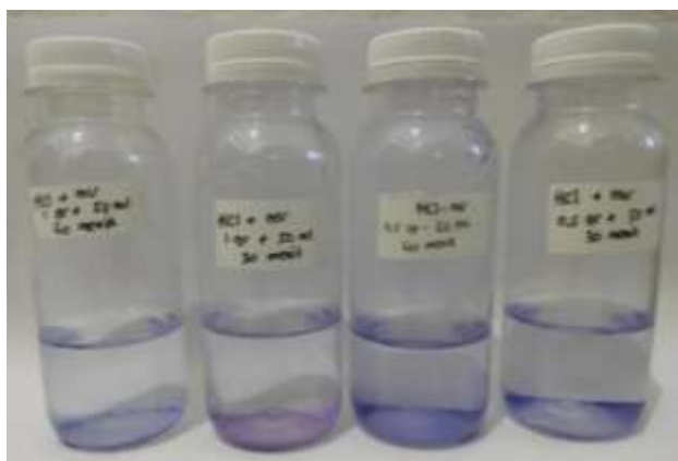
Fig. 4. Methyl violet sample after adsorbed with ZAA

The most ineffective adsorption results were obtained with an adsorbent with a mass of 0.5 g of zeolite and a stirring time of 60 minutes with an adsorption capacity of 27.36 mg/g. This is because the adsorbent in these conditions has the lowest surface area and pore volume compared to other samples, so the absorption of methyl violet that occurs is less effective. The results of this study were better than some previous studies, namely the adsorption of natural zeolite on methylene blue dye with variations in acid-base activation, where the maximum adsorption capacity obtained was 19.98 mg/g with 3 M NaOH activator, while the adsorbent which 3 M HCl activated obtained an adsorption capacity of 18.38 mg/g (Al-Duri, 1995). Other studies have also shown that natural zeolite that has been physically activated can adsorb 75.77 mg/g of methylene blue at a concentration of 200 mg/L, and the mass of zeolite used is 20 mg (Wiyantoko et al., 2017).