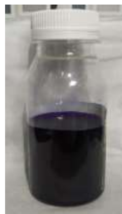
Fig. 2. Methyl violet standard solution

In addition, the mass of the adsorbent and the stirring time also affect the absorption efficiency. Zeolite has an open pore structure with a large surface area, allowing higher dye molecule absorption. So that if the adsorbent mass is more significant with a longer stirring time, the adsorption process will be more effective. This is proven by the highest efficiency obtained from adsorption with a mass of 0.5 g of zeolite with a stirring time of 60 minutes. When zeolite was activated using HCl, methyl violet's absorption efficiency decreased. The adsorbent showed the most efficient adsorption with a mass of 1 g of zeolite with a stirring time of 60 minutes. The adsorbent added with HCl is different from the adsorbent added with NaOH, which has an open pore radius, the adsorbent with the HCl activator has a lower pore radius so that the desorption process is likely to occur because the absorption takes place on the surface-active site, not on the active pore site (Alimano et al., 2014).