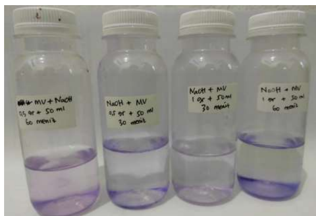
Fig. 3. Methyl violet samples after adsorbed with ZAB