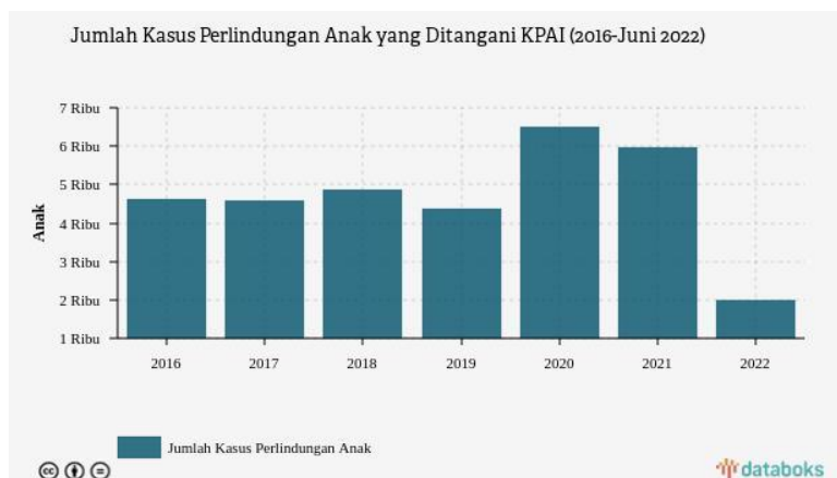
Picture 1. The number of children's protection cases Handled by KPAI

Lately we often see several delinquency actions carried out by students. Various forms of delinquency of students increasingly coloring life today, making parents,educators, community leaders and even the government is anxious. As one alternative solution problem, the government establishes a strengthening policylearningcharacter for the whole community.