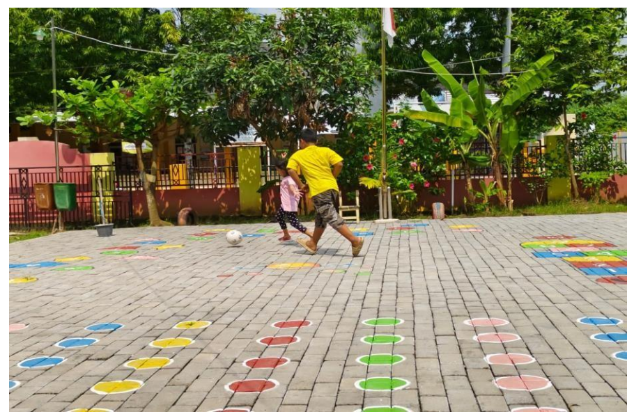
Figure 2. Children's activities are playing involving gross motor skills

aggressiveness or anxiety. The first teacher noted a significant change in the children's mood after doing the movement and song activities, where they became calmer and ready to continue other learning activities.