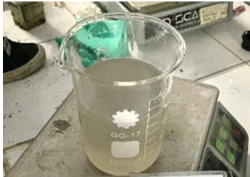
Figure 2. Alkaline Activator

After making an alkaline activator (geopolymer raw material), test specimens in the form of soil with fly ash-based geopolymer mixture for specific gravity testing. The steps for making specific gravity test specimens of fly ash-based geopolymer mixtures are as follows: