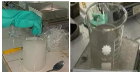
Figure 4. Preparation of Alkaline Activator (NaOH and Sodium Silicate)

The soil-specific gravity test was conducted to determine the effect of fly ash-based geopolymer proportion on soil-specific gravity. This value can also show the soil category based on specific gravity and can be used in compaction data analysis. The test used a pycnometer on the original soil and mixture variation. The author conducted specific gravity testing at the Civil Engineering Laboratory of UNTIRTA. Specific gravity testing is shown in Figure 5.