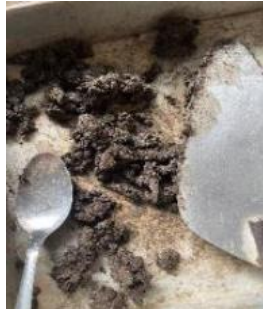
Figure 3. Soil mixture with fly ash based geopolymer

The researchers used soil samples from Kubang Laban Street, Serang Regency, Banten (-6.002174, 106.085387). Soil collection was carried out on the soil around the road. The method of sampling soil in the field is by digging the soil on the side of the road approximately 10-20 cm deep from the ground surface. After digging, the soil was taken and put into a sack that had been prepared. Mixing soil with fly ash-based geopolymers and making of Alkali Activator is shown in Figure 3 and Figure 4.