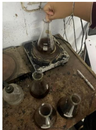
Figure 5. Specific Gravity Testing

The soil-specific gravity test was conducted to determine the effect of fly ash-based geopolymer proportion on soil-specific gravity. This value can also show the soil category based on specific gravity and can be used in compaction data analysis. The test used a pycnometer on the original soil and mixture variation. The author conducted specific gravity testing at the Civil Engineering Laboratory of UNTIRTA. Specific gravity testing is shown in Figure 5.