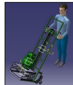
Figure 3. Loading and unloading simulation