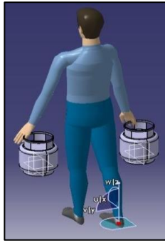
Figure 1. Existing loading and unloading

In addition, preliminary research was carried out to calculate manual lifting loads using the recommended weight limit (RWL) for workers, and the resulting loads that are currently occurring are in the high category.