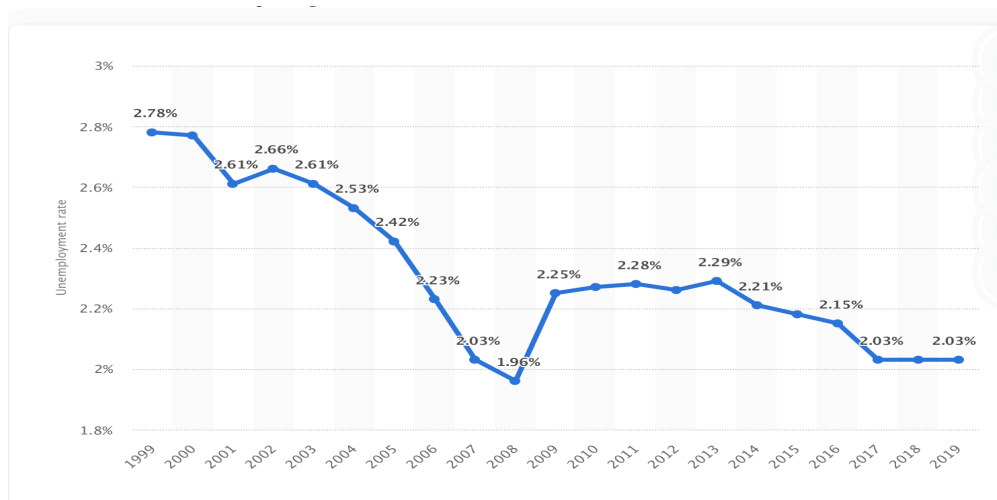
Graphic 2. Number of Liberian Unemployment Rate (1999-2019)