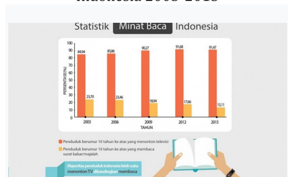
Graphic 1. Reading Interest Statistics in Indonesia 2003-2015