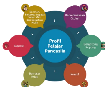
Figure 2. The Pancasila Student Profiles Dimensions

The character values that students should achieve can be maximized by understanding and implementing them in their everyday lives (Widayanto, 2023). Below is a diagram of the six dimensions of the Pancasila Student Profiles.