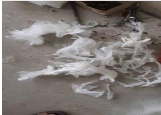
Figure 1. HDPE

The results above are the results of testing each chopping. Here are the chopped results for each type of plastic with different variations, as shown in Figure 1-3.