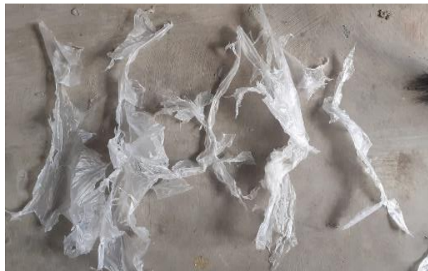
Figure 4. Size of plastic waste after cutting by shredder machine plastic