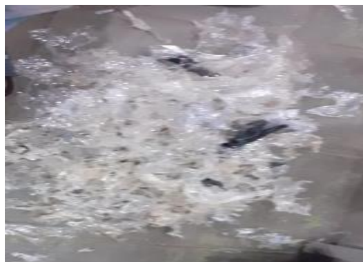
Figure 2. PE