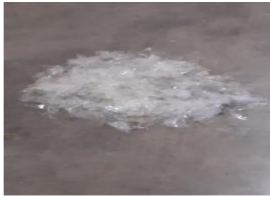
Figure 3. PP

For the chopping results according to the table, the chopping size results are according to the standard, namely 2 cm, which is in accordance with the standards of Minister of Public Works Regulation No. 3:2013 regarding the size of the chopped waste, which is 2 cm.