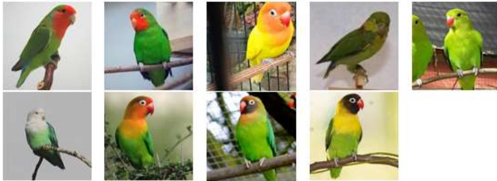
Figure 4. Lovebirds Datasets

The dataset plays a critical role in image classification tasks. A dataset is a curated collection of digital images along with corresponding labels that define the classes or categories of the images. The success of an image classification model heavily depends on the quality, diversity, and size of the dataset used for training [16]. The dataset taken is open source with a total of 8,992 files with image extensions (.jpg) as shown in the sample in Figure 2. The dataset is processed to the classification stage with the first process grouping data based on the type of species. There are 9 folders containing ~800-1500 data that have been prepared for training sessions. Furthermore, the data is processed with Background Subtraction and image segmentation to obtain data with a homogeneous background [6]. 20% of the data has been used for training and 80% for testing.