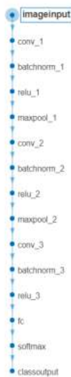
Figure 1. Flowchart of Proposed Diagram

This study uses the Deep-CNN model with 15 two-dimensional layers along with several parameters, which are visualized in the flowchart above. The training process is carried out in the Deep-CNN model consisting of Convolution, Batch Normalization, ReLU, and Max Pooling which are repeated 3 times. Then do the complete classification process. After repetition, a complete classification process is carried out, Fully Connected, Softmax, and Classification Output. Further explanation of the process is in Figure 1.