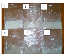
Figure 1. Carrageenan powder by microwave drying: (A) 20 minute, (B) 25 minute, (C) 30 minute, (D) 35 minute, (E) 40 minute, (F) 45 minute, and 5, 10, 15 minute still wet.

A white degree is one of the essential parameters for determining the physical quality of the SRC can be seen in Fig. 1 the final product [16]. Whitish-colored consumers generally prefer SRC with a high degree of brightness. From this study, the best white degrees were obtained, namely 63.3% in the treatment time of 30 minutes drying. This value shows the appearance of carrageenan with a color close to yellowish-white. The value of the white degree produced in this study is still lower than the value of the white degree of carrageenan from the results of the study by [17] where SRC is dried using an oven at 50°C for four hours has a white degree of 70.19% with the appearance of the resulting white color. The difference in color produced is due to the caramelization reaction that occurs when the drying process takes place materials with low water content can experience caramelization reactions [18]. The brightness of the material color during the drying process may decrease with the length of the drying time. [19].