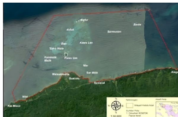
Figure 3. Customary Management Area Limits (Arafat et al., 2022)

In Malaumkarta Village, the Moi Kelim community also applies sasi , but the sasi adopted is partial sasi . With this type of sasi , the Moi Kelim people can distinguish three things: 1) Access rights are limited only to the Mobalen sub-clan; 2) Type of species caught; 3) Time. These three things are a form of adoption of external knowledge aligned with the needs and characteristics of the economic activities of the Moi Kelim community (Hidayat & Sidik, 2019). Meanwhile, the sasi / egek management area stretches from the west coast in the Klamiwin, Klabo, and Kalatebe areas to the east coast in the Klagin area. From the coast, the boundaries of the sasi / egek management area extend to Um Island to the coral reef area around it (Arafat et al., 2022). The community is imaginatively described, as shown in Figure 3.